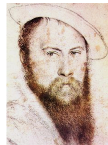
Thomas Wyatt by Holbein

Facsimile of the beginning of the Magna Carta. King John's unsuccessful military efforts were expensive and required heavy taxes. The barons of the realm finally rebelled and in June 1215 forced the king to accept the Magna Carta or Great Charter. This charter limited the king's powers in various ways, declaring that he was not above the law. It was reissued later in several modified versions. The chart above shows descents from 13 of the 25 barons who were sureties, responsible for guaranteeing that the king followed the charter.